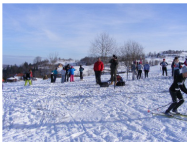
Preparations before the competition