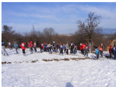
Getting together at the start point