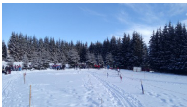
View of the start and finish place of the competition in Beliș