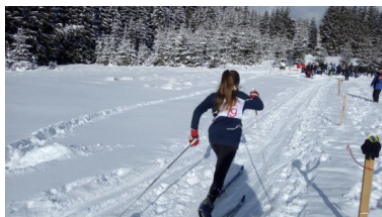
Racing against the clock towards the finish line