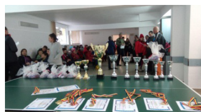
Waiting for the award ceremony