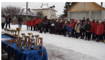
Before the beginning of the award ceremony in Râșca