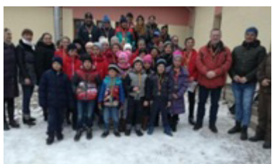
The group of participants in the presence of mayor Petru Prigoană