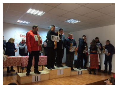
On the award podium, the team leading teachers