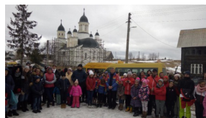
Gathering of participants before the award ceremony