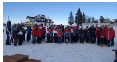
The rally point for the award ceremony