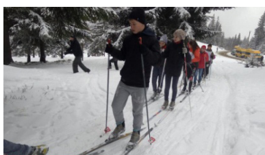
Competitors inspecting the course