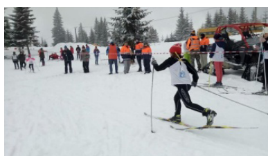
The competition is on!