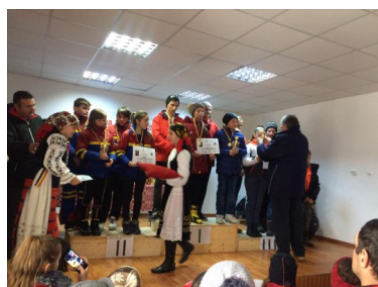
Award ceremony for the relay event