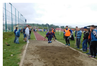
Competitors during the long jump event.