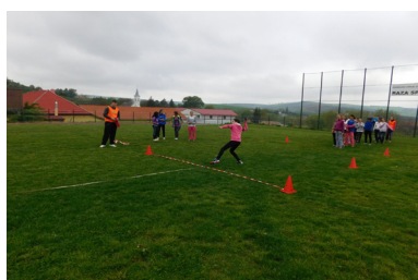
Rounders ball throw