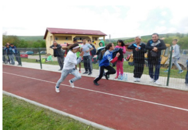
Image during the sprint race.