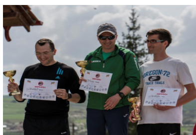
Teachers on the podium: I-Cămărașu School, II-Bonțida School, III-Mociu School.