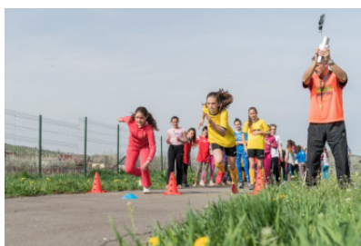
Start of the sprint event.