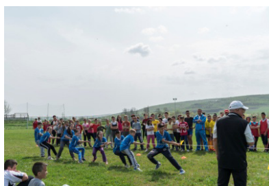
The tug of war event.